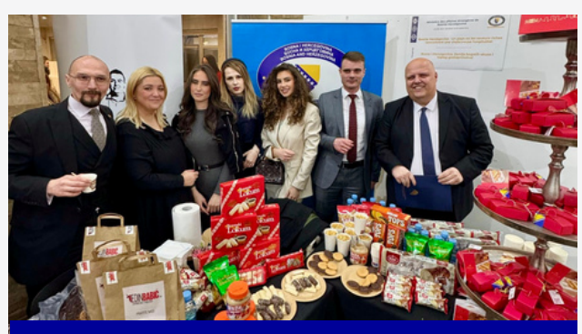
Young Diplomats Club at the Francophonie Days in Sarajevo

As part of the opening of Francophonie Days in Bosnia and Herzegovina, the Ministry of Foreign Affairs participated in the Francophonie Gastronomic Evening organized by the Embassies of France, Belgium, Switzerland, Romania, and Bulgaria. For the first time, the Ministry's Young Diplomats Club took part in the event with a dedicated stand, promoting domestic companies and locally produced goods, emphasizing Bosnia and Herzegovina's cultural and economic presence within the Francophone community.