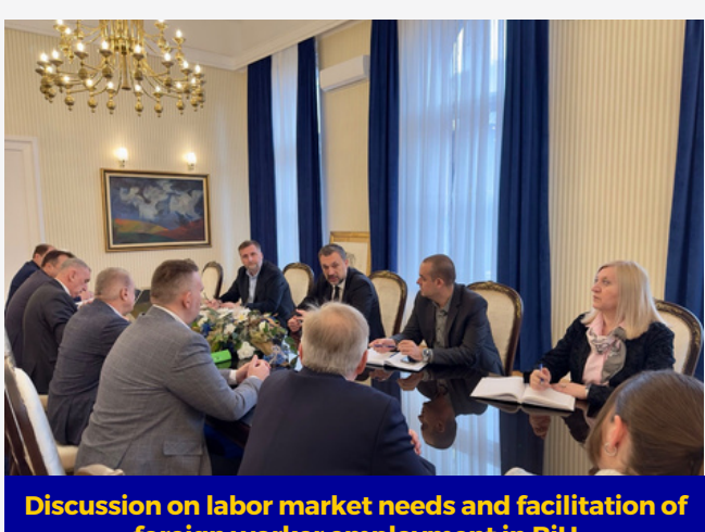
foreign worker employment in BiH

The meeting addressed current labor market challenges in Bosnia and Herzegovina, with a focus on streamlining procedures for the employment of foreign workers. Discussions emphasized the need for administrative efficiency, consular support, and safeguards against procedural misuse.