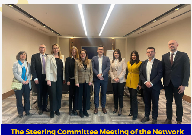
The Steering Committee Meeting of the Network of the Ministries of Foreign Affairs of the Western Balkans Region

The EU's strong active role in Bosnia and Herzegovina with a view to monitoring progress in meeting key priorities, implementing reforms, and aligning the legislation with EU acquis remains unquestionable. In this context, it was underlined that the appointment of the Chief Negotiator and the negotiation team is crucial for the successful start of the negotiation process, with a focus on further aligning legislation with the acquis. It was also pointed out that Bosnia and Herzegovina must seize the current momentum to continue advancing on its European path.