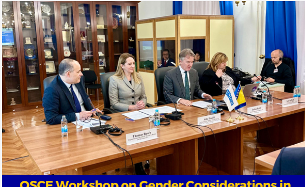
OSCE Workshop on Gender Considerations in Cyber/ICT Security at the MFA Bosnia and Herzegovina