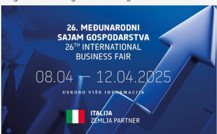
26<sup>th</sup> International Business Fair - MOSTAR 2025 Partner country - Italy

Just before the tourist season, the prestigious Czech magazine Zeme Sveta dedicated its spring edition to Bosnia and Herzegovina. On more than 80 pages of excellent reports and travelogues accompanied by beautiful photographs, Bosnia and Herzegovina is presented in an exceptional way for the Czech market and Czech tourists. The Embassy of Bosnia and Herzegovina in Prague will also organize a special presentation of the magazine for distinguished Czech guests.