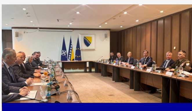
Meeting with NATO Secretary General Mark Rutte

NATO Secretary General Mark Rutte paid a visit to Bosnia and Herzegovina on March 10th, 2025, and held high-level meetings with the members of the Presidency of Bosnia and Herzegovina, the Chairwoman of the Council of Ministers, the Minister and Deputy Minister of Foreign Affairs, the Minister and Deputy Ministers of Defense, the Acting Minister of Security, the Commander of NATO Headquarters Sarajevo, the High Representative for BiH, and the Commander of the EUFOR mission.